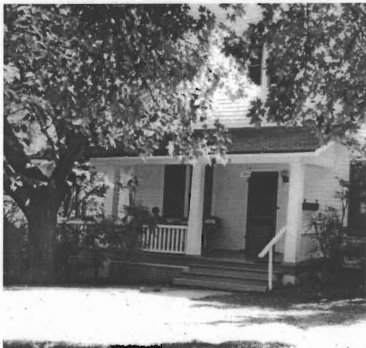
The Lemke Home at 231 E. Dickson

We entertained University groups quite often - the journalism girls, the Press Club, and a group of my faculty friends. Your mother, then as now, liked to bake and cook and soon got a reputation as one of Fayetteville's finest cooks. Even today (1957) the alumni ask if mother still bakes "those Press Club beans."