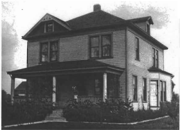
The Hamp home on Baltimore Ave.