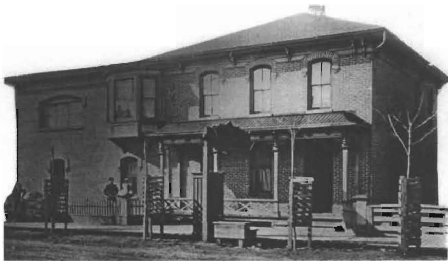
508 Jefferson Street, Wausau, Wisconsin

One of our favorite sports as youngsters was to fish in the sidewalk cracks and many a coin and other article we found. Also, many a sliver we got in our bare feet from those sidewalks. The boards would rot or break and had to be replaced and that was always the occasion for a big treasure hunt under the sidewalks. When walking on board sidewalks, we tried not to step on the cracks, as that was supposed to bring bad luck.