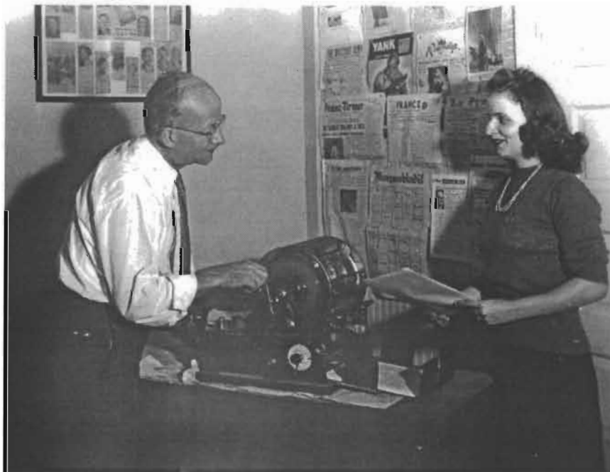
Working on the WWII Newsletter