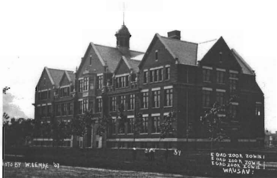
Wausau High School in 1907