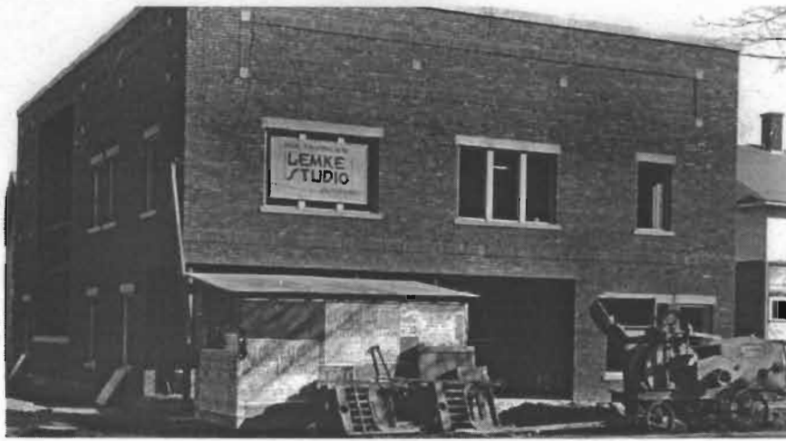
The new Lemke Studio under construction.