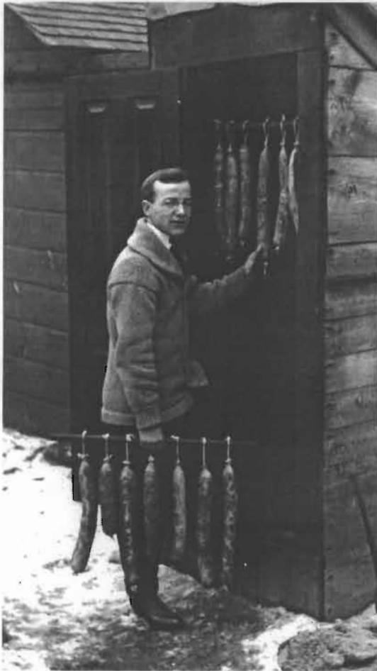
The Lemke Smokehouse