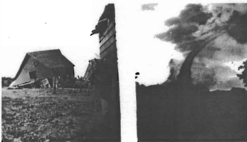
The Enterprise, Kansas Tornado

I'll relate one other Enterprise incident and then move on. On Easter Sunday 1913, I was aroused from an afternoon nap by whistles, bells and much noise. When I got outside, I learned that a "twister" was approaching. I rushed back into the house for my camera. The Academy students had all taken refuge in the basement of the main building and in a combination cyclone-fruit cellar behind the girls' dormitory. I headed for the latter. When I got here, I found it packed full of people. They were singing "Nearer my God to Thee." Several of us who couldn't get into the cellar gathered outside and watched an awe-inspiring sight. Two parallel funnels swept up the valley of the Smoky Hill River, just a quarter-mile from where we stood - on a hilltop. I didn't have sense enough to be scared.